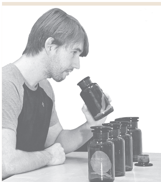
Fig. 50.1 An odor sample rating session

nitrogen, carbon dioxide, hydrogen and methane, and odorous ones containing sulfur, the production of which could be affected by dietary habits [50.45]. Higher levels of sulfur occur in some breads, dried fruits, brassicas and soy flour. A study where flatulence was increased in participants due to consumption of pinto beans and lactulose found that flatus malodor correlates with the concentration of hydrogen sulfide (reminiscent of rotten eggs) and methanethiol (decomposing vegetables) [50.58]. Similarly, urine of people who have recently eaten asparagus has an unusual sulfurous odor similar to cooked cabbage [50.44].