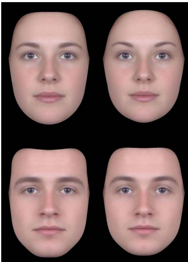
Fig. 1 Examples of masculinised (left) and feminised (right) composite female and male faces. To make each composite face, individual faces had salient points marked on them and were then blended together to make the single identity and the average face shape. Images were transformed using the difference between a composite of 50 men and a composite of 50 women

Research into preference shifts for putative good-gene marker traits has gathered pace in the years following Gangestad and Thornhill's (1998; see also Penton-Voak et al. 1999b) study showing that women in the fertile phase of their cycle (but not those in non-fertile cycle phases nor those using hormonal contraception) expressed preferences for the body odours of relatively symmetrical men and that the strength of this preference correlated with conception probability. The authors suggested that stronger preference for indicator traits at conception than elsewhere within the cycle suggests the possibility that these shifts may reflect a