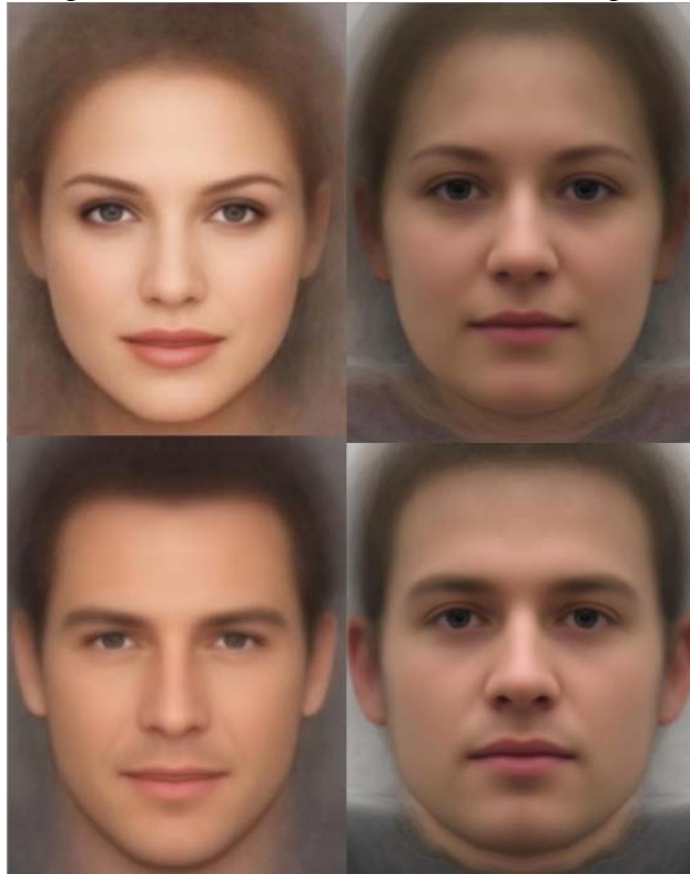
Figure 1. Composite images of celebrities (left) and students (right)